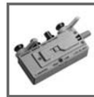
9263 SMD TEST FIXTURE DC to 5 MHz