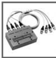
9261 TEST FIXTURE DC to 5 MHz