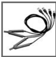
9140 FOUR-TERMINAL PROBE DC to 100 kHz