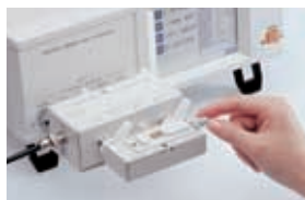
Example of connecting the 9262 and 9268 / 9269

The 9268 can be used for voltages up to a maximum of DC \pm 40 V. The 9269 can be used for currents up to a maximum of DC \pm 2 A.