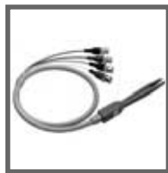
9143 PINCHER PROBE DC to 5 MHz