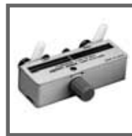
9262 TEST FIXTURE DC to 5 MHz