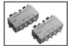
9268 DC BIAS VOLTAGE UNIT Maximum applied voltage: \pm 40 V DC 9269 DC BIAS CURRENT UNIT Maximum applied current: \pm 2 A DC